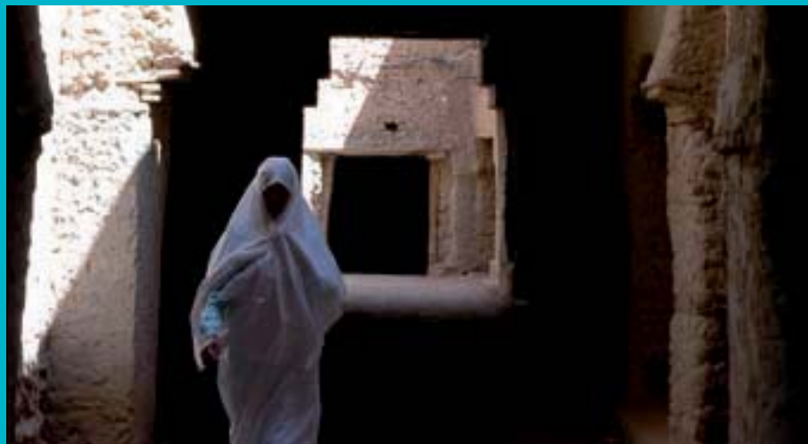
A street in a Figuig ksar

The dunes around Figuig are ideal for sand-bathing, reputed to be an effective cure for rheumatism.