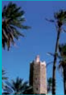
The mosque in Figuig

Figuig is the nearest oasis to Europe – a town resonating with history, its ancient walls enclosing a mosque dating back to the 5th century Hijri, and preserving the age-old customs and way of life of its imposing Ksours.