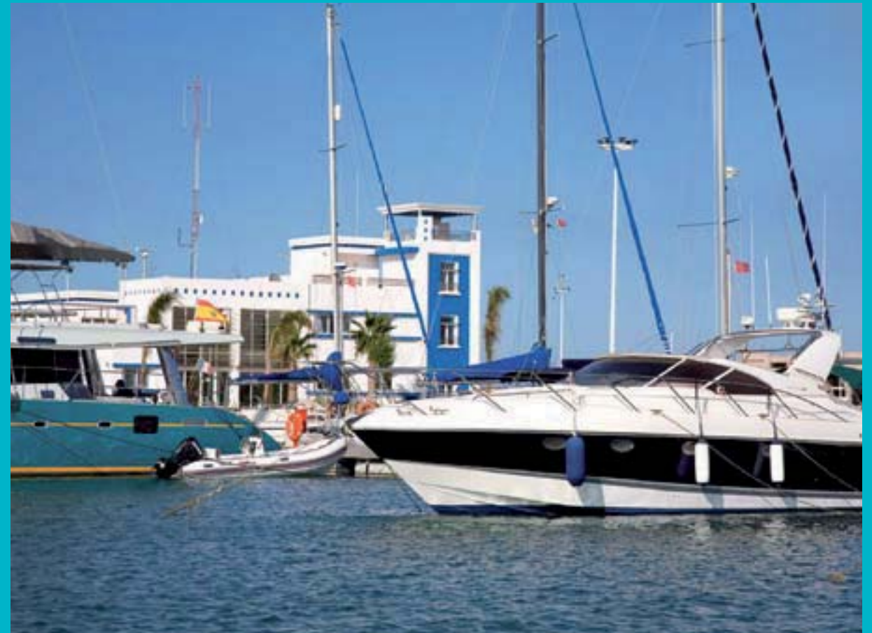
Marina Saïdia offers all the services to be expected of a major yachting harbour, and is set in elegant residential surroundings