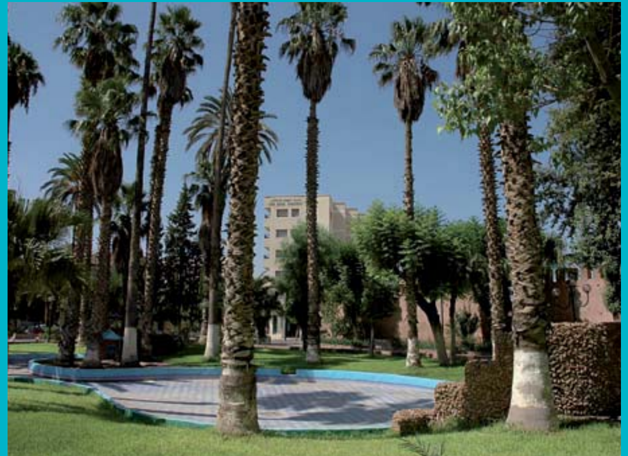
Bab Al Gharbi square in the Oujda medina

Little remains of the walls that once surrounded the medina except for a couple of its gateways – Bab Al Gharbi and Bab Sidi Abdelouahab. The latter was built in the 13th century and is the better preserved of the two. The square that faces it once served as a resting place for caravaneers arriving in the city from the East. Built in 1298, the Al Kabir Mosque (the "Great Mosque") with its three fountains is the city's oldest monument. To the left of its main entrance, a narrow little side street (almost impossibly so in parts!) leads, to one of the medina's architectural highpoints – the Merinid Medersa. Although of no great size, it is regarded as a masterpiece of Merinid art, and is a living testimony to the city's rich cultural heritage.