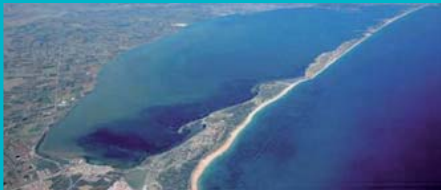
Mar Chica lagoon

Cross the bridge over the Moulouya, continue on for a few kilometres, and you come to the fishing village of Ras El Ma and its beach, sheltered by the mighty cliff that overlooks it and all the more appealing for the miniature eucalyptus wooded dunes that adorn it.