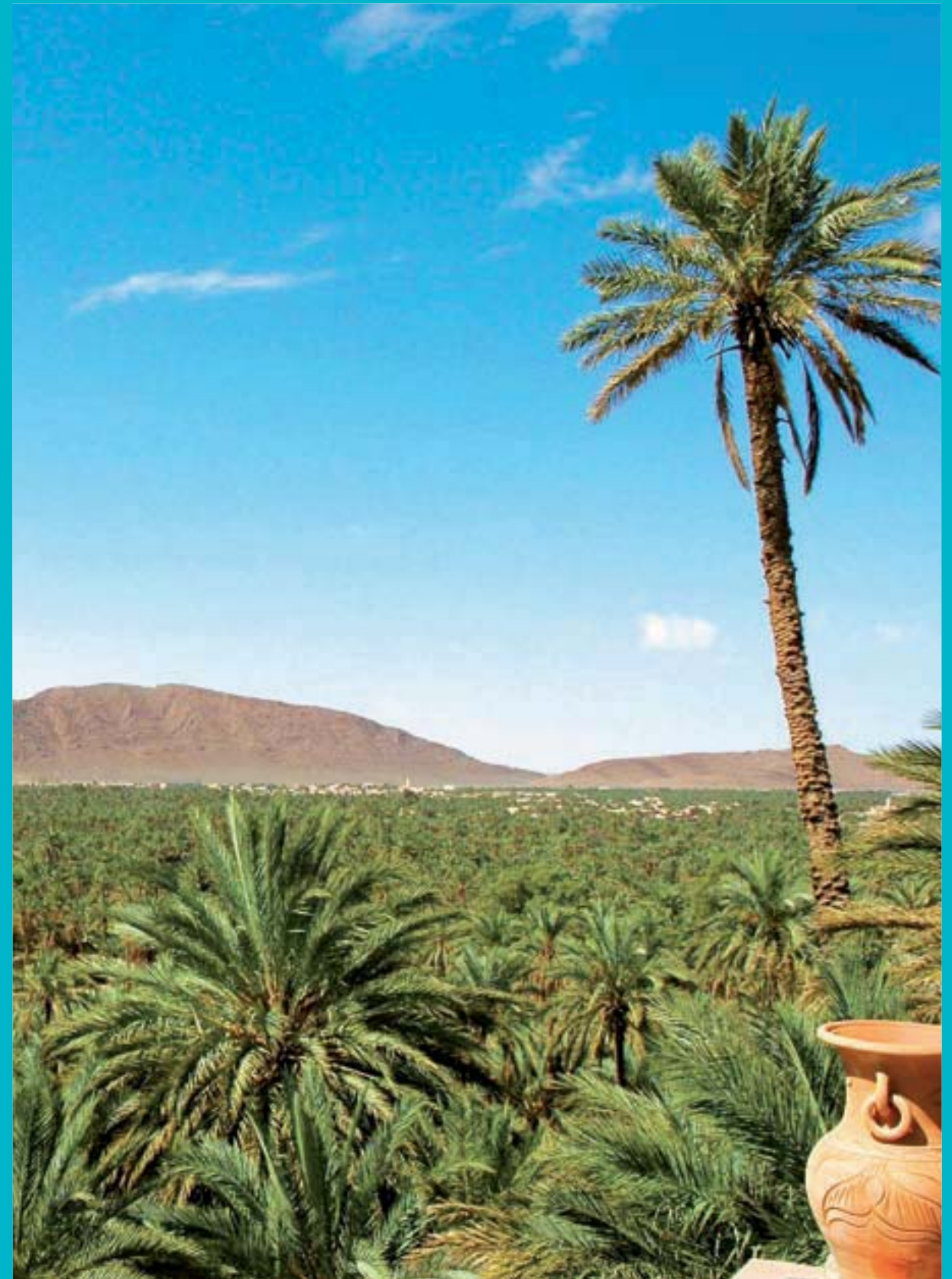
Figuig palm grove