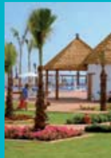
The front door to Morocco's Oriental region

(Currency regulation authority): www.oc.gov.ma