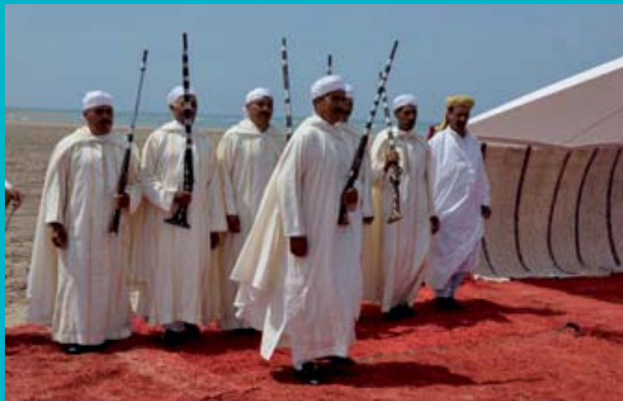
Reggada folklore troop

Held every August, the festival pays tribute to Reggada, a musical form born of Beni Snassen tribal tradition, and part of a local artistic heritage that has broken free of its confines to inspire musicians at national and international level. The festival also features top names in Raï and Gharnati music and in the popular arts.