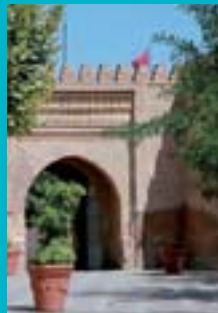
Bab Al Gharbi in Oujda's medina

Oujda - a much underrated city You won't regret paying a visit to the town of Oujda, a fascinating crossroads between North Africa and Europe, with a long Berber, Ottoman and Arabo-Andalusian history behind it.