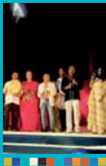
Open-air festivities, music, dance – so- mething for everyone!