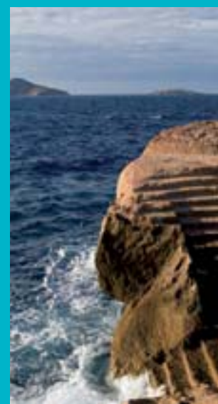
Ras el Ma

There is certainly no lack of restaurants in Saïdia, serving a vast choice of fish and seafood dishes based on produce caught at the resort itself, or brought in from Nador or Ras El Ma ("Cape of Water") nearby. There's also plenty of international cuisine on offer, along with typically Moroccan gastronomy, delicious sea-bean paella or rather more classic suggestions such as chicken or beef brochettes – even pizzas!