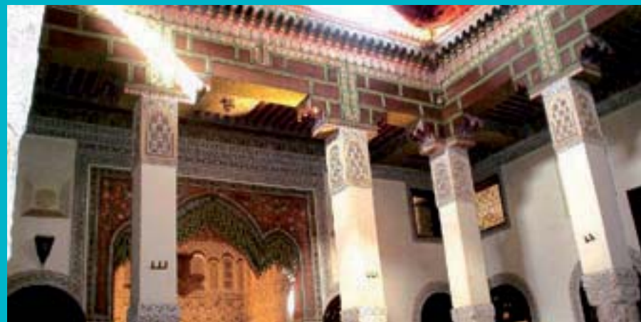
The Essebti Palace

The medina lies in the very heart of the city, filled with life, colour and carefree bustle, and bathed in radiant Mediterranean sunshine. Take a lazy stroll through narrow little streets teeming with people wandering hither and thither about their business. Let yourself be drawn by the scents of a thousand and one spices, of mint tea, coffee, and beignets, happening upon this or that little square or archway-lined courtyard where the local weavers sit busy at their craft... And don't miss out on Souk El Ma (the "Water Market"), where water for keeping local garden green was once sold.