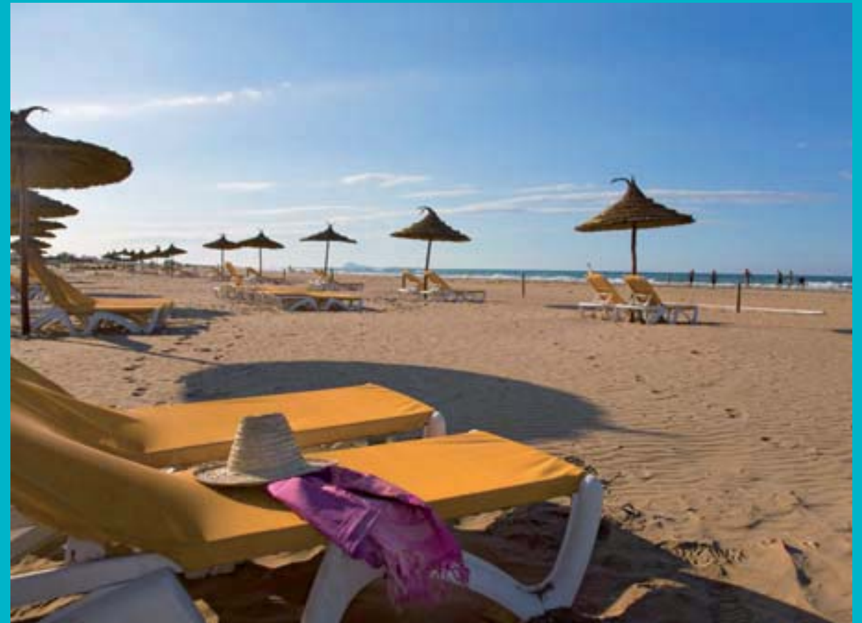
Relaxing in the shade of a beach umbrella, with an eternally blue sea stretching before you - the art of living Mediterranean style!

The Mar Chica lagoon at Nador is an altogether magnificent piece of natural seascaping, with a total surface area of some 115 km 2 and from 0.5 to 7 metres in depth. Separated from the sea by a thin ribbon of dunes 24 kilometres long, it communicates with the Mediterranean via a channel known as the Boucana pass and is bordered by fine shell-sand beaches – an ideal destination for fishing and water sports enthusiasts.