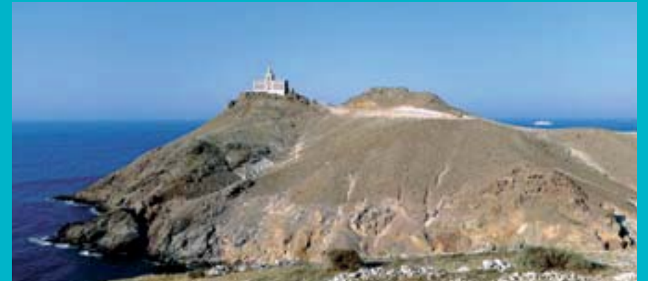
Cape of Three Forks

You really can't spend a holiday in Saïdia without going to have a look at the Beni Snassen Mountains, a small Mediterranean massif reaching a height of 1,535 metres and a natural and cultural treasure house.