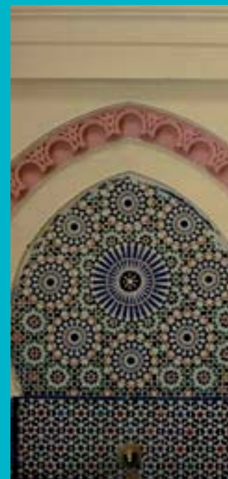
One of the Great Mosque's fountains

Dar Essebti Palace stands just outside the medina and is of considerable architectural interest. Very well worth visiting, it was built in 1938 and was originally the residence of a wealthy merchant. Today it is a venue for ceremonies, cultural events, and exhibitions, and also houses the head office of the Gharnati Music Research and Studies Centre. The city also boasts some fine examples of architecture left over from Protectorate days (the Banque du Maroc, the former Staff Headquarters, and the old railway station) as well as a number of more recent creations of interest.