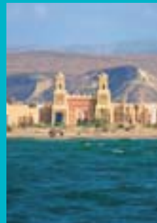
Saïdia's architecture is a harmonious blend of ancient and modern